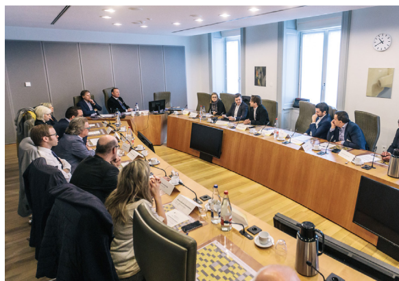
Voka is an officially recognised social partner in the social consultations in Flanders.

As the largest and most representative employers' organization in Flanders, Voka is a neutral and reliable partner to the government. Therefore Voka is recognised as a social partner in the official deliberative bodies.