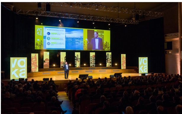
The Voka congress annually unites more than 1.000 entrepreneurs during a unique experience. The congress is one of the largest national activities for entrepreneurs in Flanders.

Various network activities in Flanders bring entrepreneurs closer to each other.