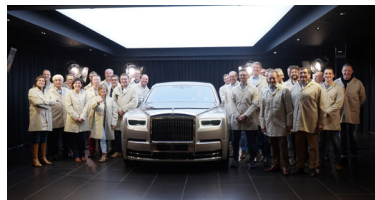
A delegation of Voka members during a visit of Rolls Royce headquarters at Goodwood, United Kingdom.

Voka organises trade missions, inspiration tours and participates in official delegations, together with our entrepreneurs and in close cooperation with the official services.