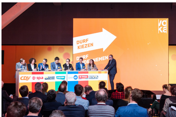
Because of the national and European elections, Voka organised several election debates with politicians and entrepreneurs in order to discuss Voka propositions.

We organise a permanent dialogue between the various authorities, governments and politicians. One of the core tasks of Voka consists of bringing politicians and entrepreneurs closer to each other.