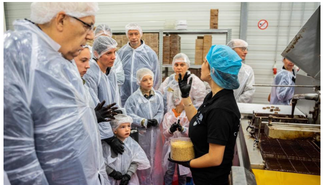
Voka Open Bedrijvendag: every year more than 600.000 interested people visit the Voka enterprises.

Once a year, Flemish companies open their doors to the public. During the Voka Open Bedrijvendag more than 350 companies are open for an exclusive view behind the scenes.