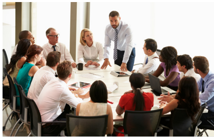
Every year more than 700 companies participate in the Voka business clubs.

Our proactive peer-to-peer learning programmes are a true success. They unite entrepreneurs and experts to exchange knowledge and good practices on doing business abroad.