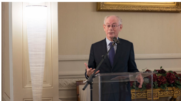
Former President of the European Council Herman Van Rompuy delivers a keynote speech at the "Legends and Leaders" Voka event series.

Voka brings the world to Flanders. Top congresses and exclusive meetings are organised to put our region on the map.